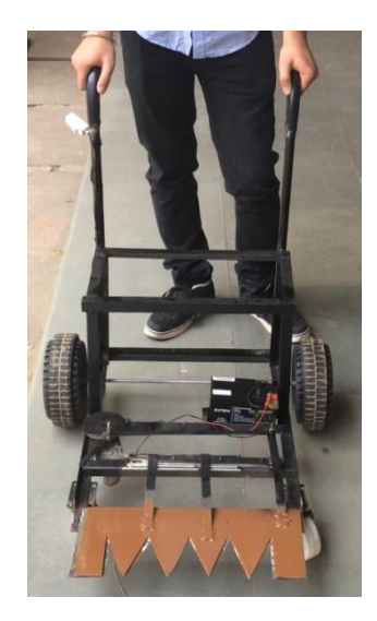
Fig.4 - Finished Assembly of Machine