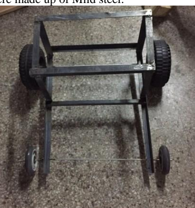
Fig. 1 – Frame of Harvester

Cutter assembly consists of two cutter blade plates. One of the cutter plates is stationary and other is sliding in nature. The cutters used are of triangular shape. In sliding cutter plate, cutter blade was riveted on 3mm plate and in stationary cutter plate; cutter blade was riveted on 5mm plate. The stationary cutter plate was directly welded and fixed on frame. Sliding cutter blade was provided with 2 slots of 80mm on its ends; it allowed sliding motion to be in straight line. The bottom of the sliding cutter plate was connected to the slider crank mechanism. The height of cutting blade is 90mm and has a base of 60 mm. The blades were made up of Mild steel.