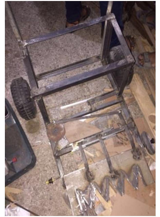
Fig. 3 – Assembly of Frame, Cutter and Wheels